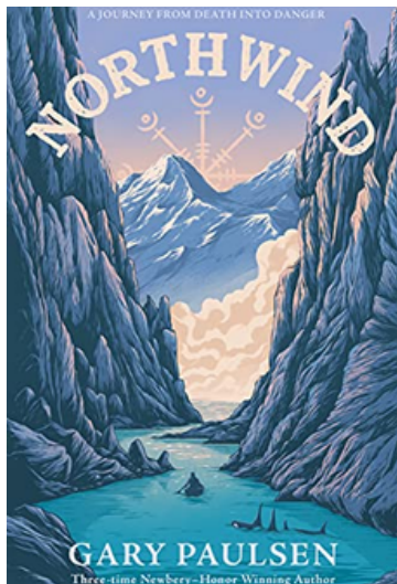
Northwind by Gary Paulsen