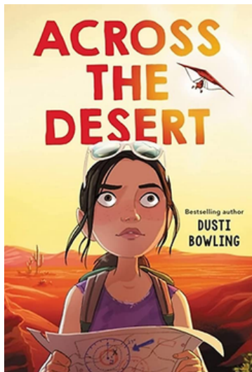
Across the Desert by Dusti Bowling