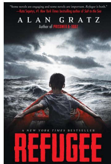
Refugee by Alan Gratz