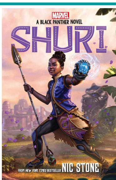
Shuri: A Black Panther Novel By Nic Stone